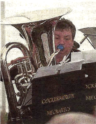
A BIT OF OOMPH : One of the musicians in the Cockermouth Mechanics Band