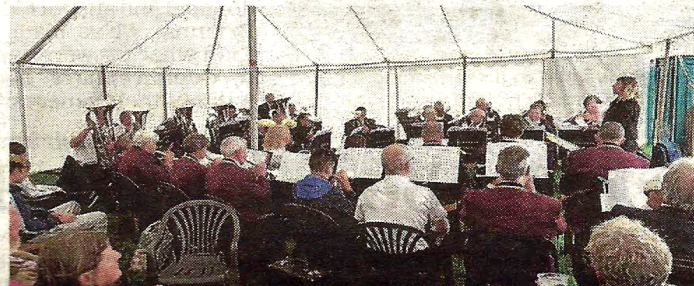
ENTERTAINMENT : Cockermouth Mechanics Band in action

THOUSANDS enjoyed everything that was on offer at Loweswater Show.