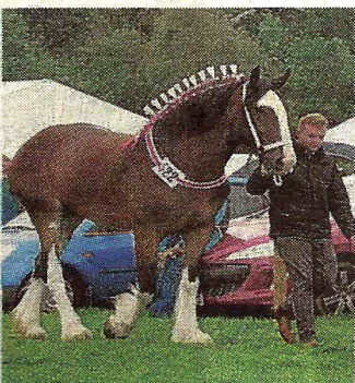
GOOD SHOW : There was an increase in the number of horses at this year's show