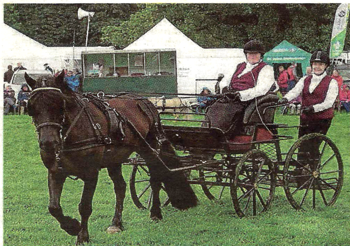
DRIVING SEAT : Team work with a horse and carriage